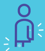
Pain or swelling in an arm or leg